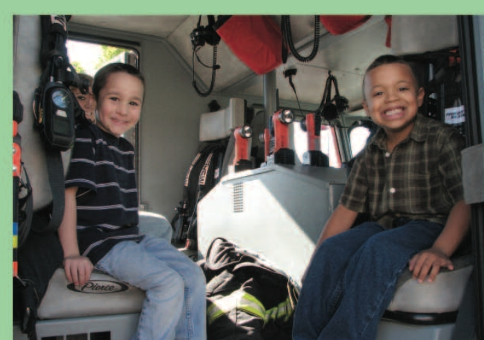
(Left) Students at RJEC learned that although the fire gear looks intimidating, firefighters are their friends.

(Right) Students at RJEC climb inside the Manchester Fire Department's ladder and rescue truck at Fire Prevention Day in October.