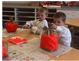
3-D Pumpkins P.I. 2A