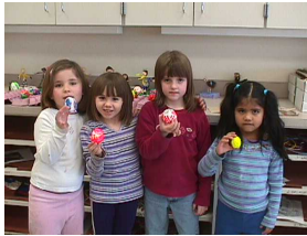
Rhythm Eggs P.I. 2A,3C Integration w/ Arts M 2.2B