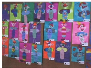
Texture Clown Collage P.I. 1A-D