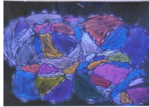
Line/Shape Design with Glue and Chalk P.I.1A,B,C,