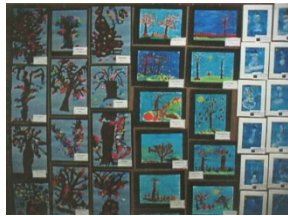
Painting P.I. 1A, 1C