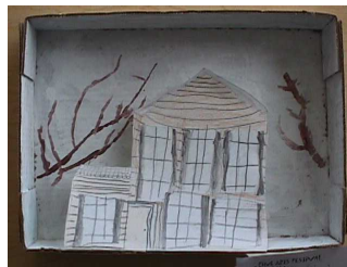
Arch. Diorama P.I. 1A Integrated w/SS 1i.1A