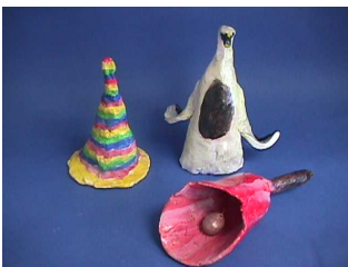
Clay Slab Constructed Hand Bells 3C, 4A Integrated with Arts M2.2B