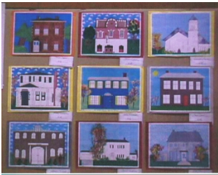
Arch. Drawing w/ Kid Pix P.I. 2A, 2B Integrated w/ MST 5.3B