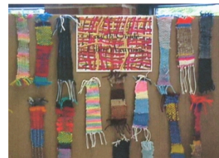
Fiber Weaving w/ Hand Loom P.I. 2D, 3B, 4A, B Integrated w/ CDOS 2.1A

Methodology: Kid Pix Deluxe 3, Architectural Heritage of Genesee County, Contacts with Landmark Society, Guest speakers in field of Architecture, School Arts , 6 Traits.