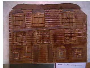
Arch. Façade Relief 1A, 1D, 1E, 2A, 2C, 4B