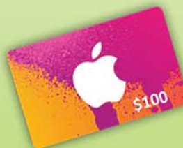
Apple Gift Card