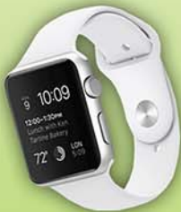
Apple WATCH SPORT

Thank you to all who participated in our #savein16 contest! There were many great contributions on our social media platforms, here are the winners: