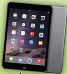
Apple iPad mini