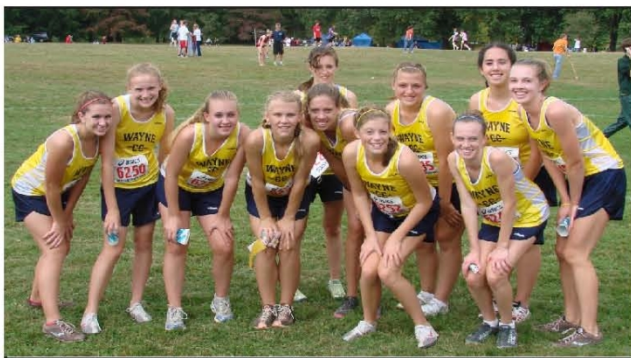
The Wayne girls X-C runners pose for a team picture following their run at the McQuaid Invitational.