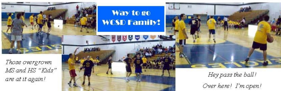
Those overgrown MS and HS "Kids" are at it again!