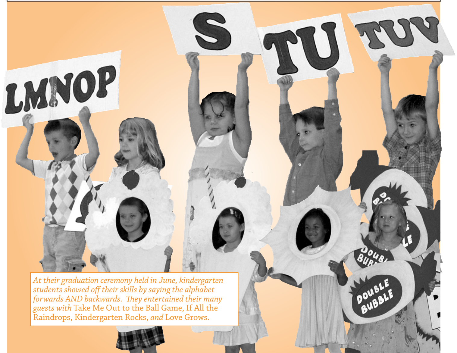
At their graduation ceremony held in June, kindergarten students showed off their skills by saying the alphabet forwards AND backwards. They entertained their many guests with Take Me Out to the Ball Game, If All the Raindrops, Kindergarten Rocks, and Love Grows.