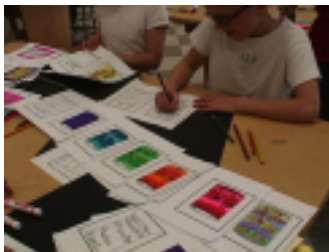
“Soup Cans” Pop Art P.I. 1A, 1B, 1C, 4C Integrated w/ SS2ii.1C,D