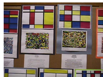
Abstract Mondrian/Pollock-Kid Pix Integrated w/ MST 5.3B, SS2ii.1C,D,”6Traits” Ideas and Organization