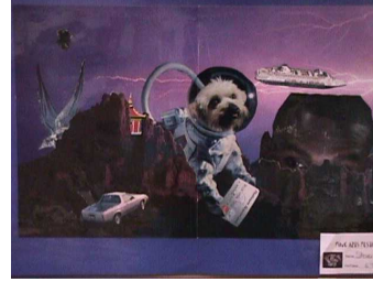
Surrealism w/ Magritte & Dali Magazine Collage Integrated w/ SS2ii.1C,D

Methodology: 20 th Century Designs Jackie Gaff, 6- Traits, Kid Pix Deluxe 3, Arts & Activities , School Arts January '03