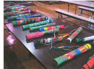
Chilean Rainsticks P.I. 2A,C,3B,C,4B,C Integrated ARTS M2.2B