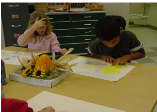
Still Life Drawing P.I.1A,C