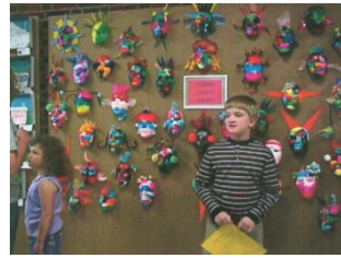
Masks; P.I. 1A, 1C, 1D