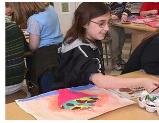
Mixing Tints P.I. 1C