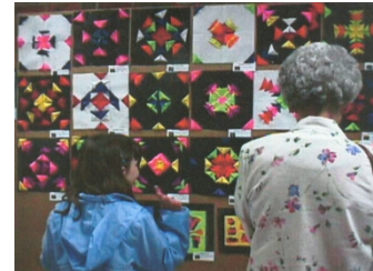
Design w/ Symmetry P.I.1A-D Integrated w/MST 3.4E, 3.7A