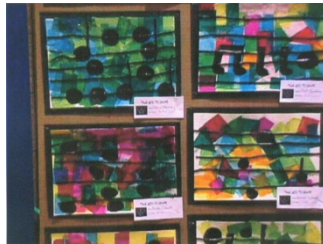
Combined media collage P.I. 1A,C,D,3,A-C