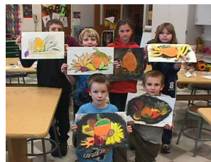
Still Life Drawing P.I.1A,C

Methodology: Kid Pix Deluxe 3, 6 Traits Writing, Library resources, Integration with Third Grade units and themes when possible. School Arts May/June 2003 issue.