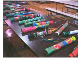
Chilean Rainsticks P.I. 2A,C,3B,C,4B,C Integrated ARTS M2.2B