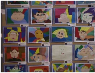
Cubistic Self Portraits Kid Pix P.I. 2B, 4A Integrated w/ MST 5.3B