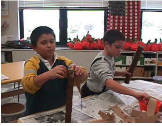
Chilean Rain Sticks; P.I. 2A, 2C, 3B, 4A