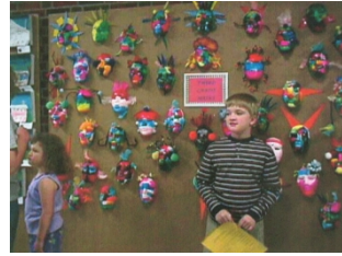
Masks; P.I. 1A, 1C, 1D