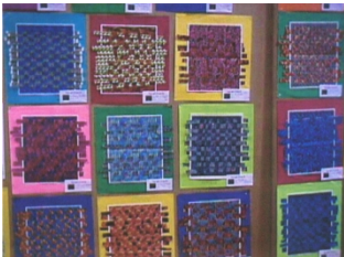
Textured Paper Weaving Kid Pix 3 Integrated w/ MST 5.3B