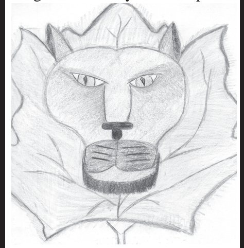
Logo submitted by CJ Fernaays